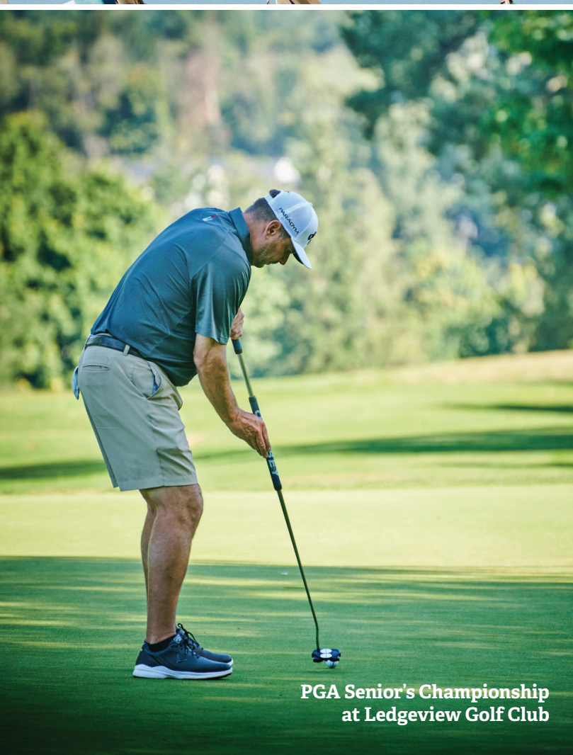
PGA Senior's Championship at Ledgerview Golf Club