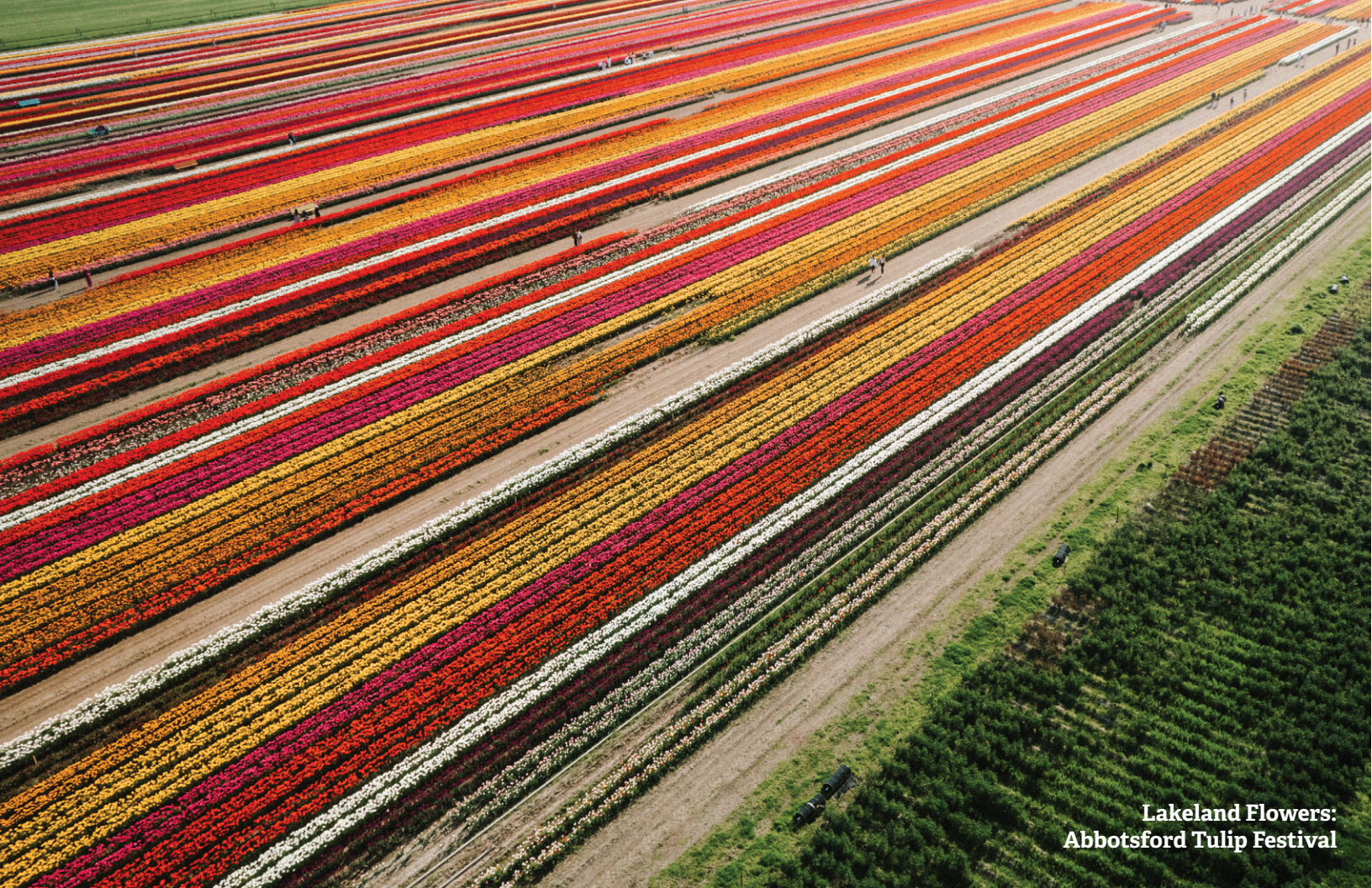
Lakeland Flowers: Abbotsford Tulip Festival